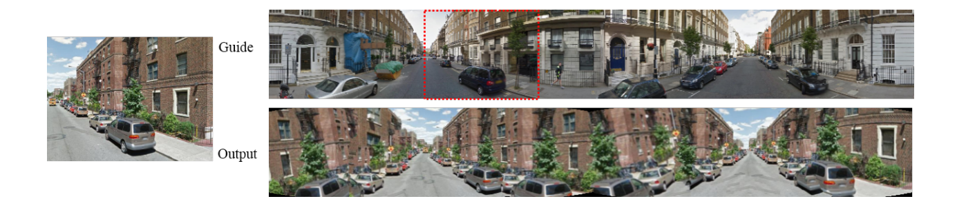
Figure 1: Panorama synthesis results on various scenes. The left column is the input image. On the right are the guide image and the synthesized image.